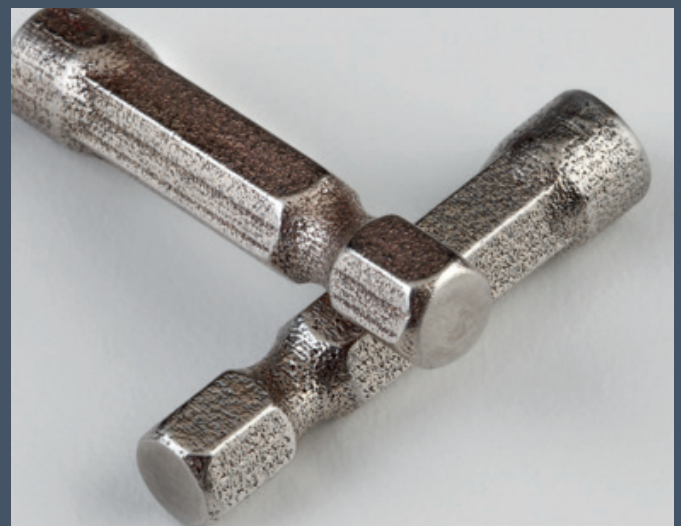
Tamper Resistant Screwdriver Bit (proprietary features hidden)